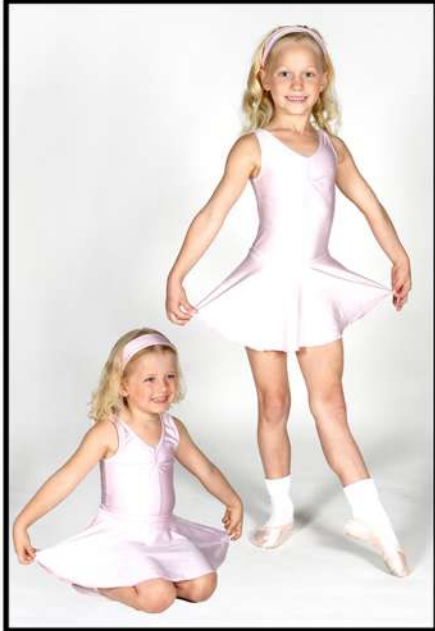
Pink Leotard & Skirt, Pink Ballet Shoes.