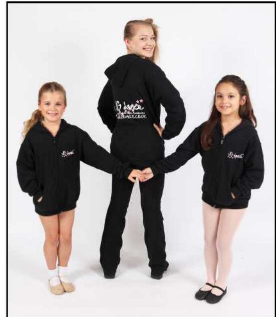
Black Hoody with School Logo.

YOU CAN ORDER YOUR DANCEWEAR FROM THE BRANCH MANAGER FOR COLLECTION THE FOLLOWING WEEK