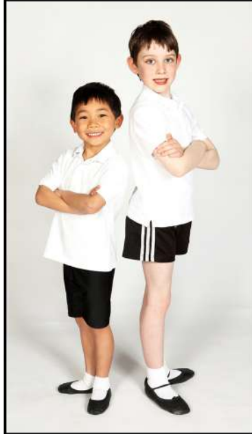
White T-Shirt, Black Shorts.