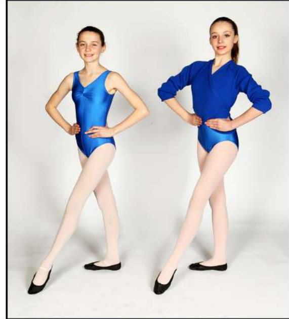
Royal Blue Leotard, Ballet Tights, Black Ballet Shoes, Royal Crossover.