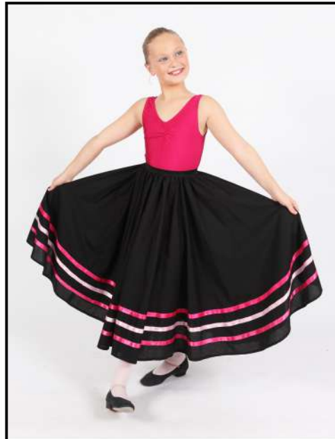
RAD Skirt, Leotard & Character Shoes.