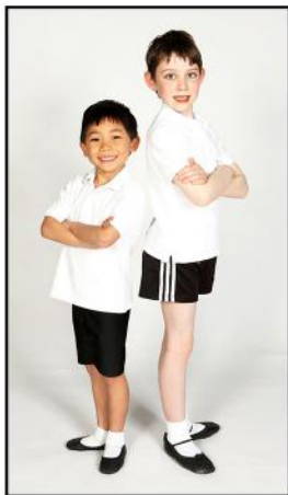
White T-Shirt, Black Shorts.