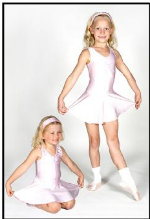
Pink Leotard & Sparkle Skirt, Pink Ballet Shoes.