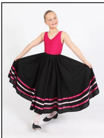
RAD Skirt, Leotard & Character Shoes.