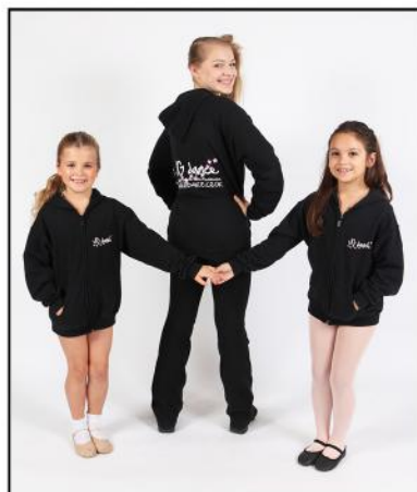
Black Hoody or Onesie with School Logo.

YOU CAN ORDER YOUR DANCEWEAR ONLINE, OR FROM THE BRANCH MANAGER FOR COLLECTION THE FOLLOWING WEEK